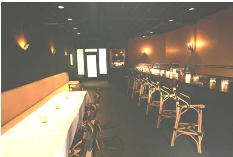
"Next to Zenbu"

Zenbu presents it's latest creation, an upscale private lounge, "Next to Zenbu." This private room a separate entrance and an exclusive "walk-up" sushi bar for 50 guests.