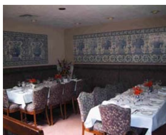
The Delft Room

Our private room upstairs with accommodations for up to 20 guests. This room has media viewing availability and is a favorite among pharmaceutical groups for presentations.