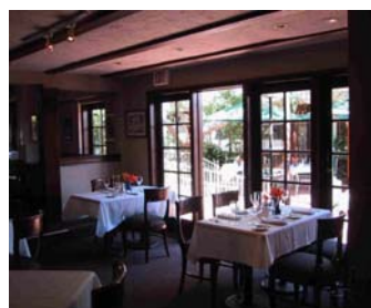
The Fountain Room

This room overlooks our courtyard and is situated next to the bar. It is used for our casual dining and can accommodate up to 30 guests.