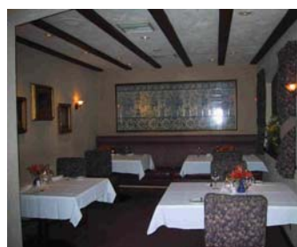
The Flower Basket

A semi-private area that accommodates up to 15 guests.