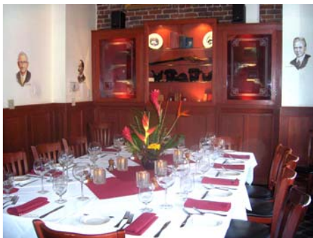
Wyatt Earp Room

Unlike most other private dining rooms in the Gaslamp Quarter that are tucked away in back, this one overlooks Fifth Avenue.