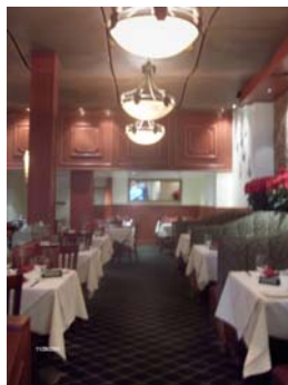
La Jolla Cove Room

$1,000 Food and Beverage Minimum, plus 8.75% Tax and 18% Gratuity