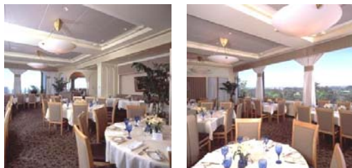
Park Banquet Room

Sunday-Thursday: $3,000 Food & Beverage Minimum Plus Tax & Gratuity Friday/Saturday: $3,500 Food & Beverage Minimum Plus Tax & Gratuity