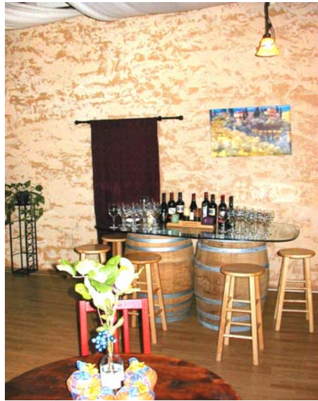
◆ Best Wine Bar, 2004 & 2005 – City Beat