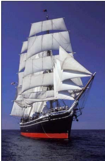
Star of India

The Star of India is the world's oldest active ship. She began her life on the stocks at Ramsey Shipyard in the Isle of Man in 1863. The Star of India now sails at least once a year making her the oldest active ship of any kind in the world. She is sailed and maintained by a volunteer crew that trains year-round, keeping not only the ship but also the skills to sail her alive. She has been called the foremost symbol of San Diego, for ships like her were the original sinews of our city's progress. Yet she is more than that—she is the essence of a vanished age, a glorious time when men and women voyaged under towers of masts and clouds of canvas.