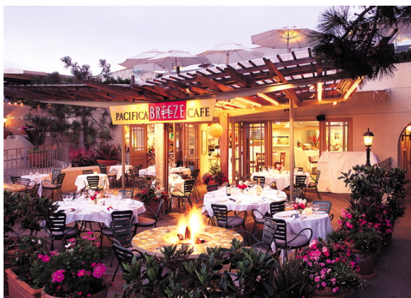
The Breeze Café

◆ Food & Beverage Minimums are Subject to Change during Special Events and Holidays.