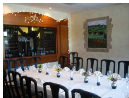
Wine Cellar Room

Friday-Saturday $1,000 Food & Beverage Minimum, plus Tax and 18% Gratuity